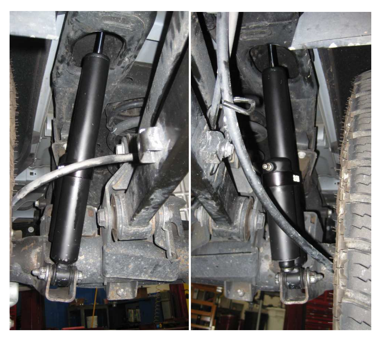
Figure 2 – Passenger side (looking towards the rear)

Figure 3 – Driver side (looking towards the rear)